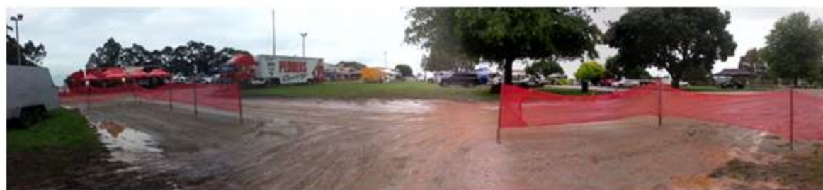
80mm of rain fell at Lardner Park on the Wednesday