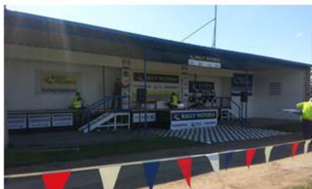
CCC Members still hard at work setting up the podium