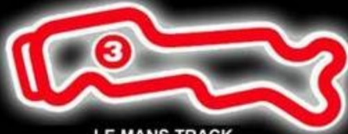
LE MANS TRACK